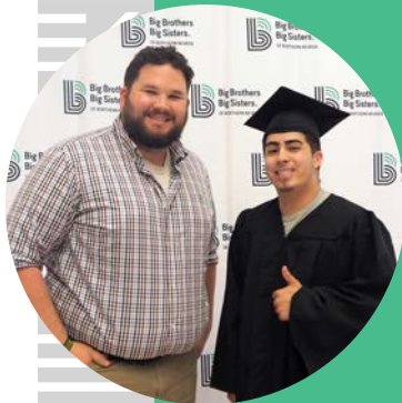
Big Brother Will Little Brother Bryan Match est. 2015

WE WANT TO SPECIALLY THANK OUR NEARLY 600 BIG BROTHERS & BIG SISTERS THAT WORKED WITH US IN 2019 TO DEFEND POTENTIAL!